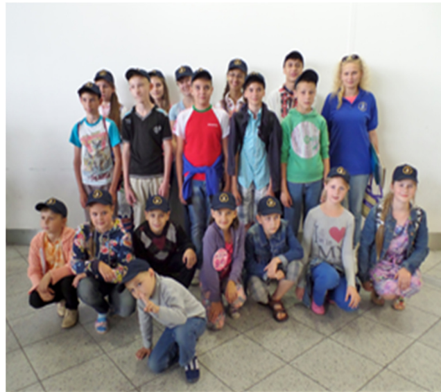
Our group of happy children in 2015